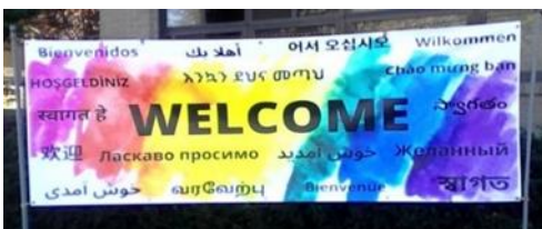
Weatherproof banner printed by Reston Copy Center.

As the library reopened for Express Services within the branch, staff sought a way to increase visibility and let the public know the branch was ready to welcome them in. Working with the library staff, and the folks at Reston Copy Center, FRRL designed and provided a large weatherproof welcome banner, printed in English and in several other languages commonly spoken in Fairfax County. Library staff have received many positive comments and compliments on the 3’ x 9’ splash of color at the branch.