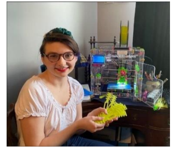
Printing mask extenders using the 3D printer

Using iPads provided by the Friends, our staff have been able to more rapidly and safely process returned materials to check them back into the system and make them available to patrons again. Once materials have completed their quarantine period, staff members can use the iPads to connect directly to the catalog system. The branch was originally issued one iPad for all of the staff to use. The Friends funded 12 iPads, plus cases, and hand held scanners for staff use. Having multiple iPads allows the staff members to spread out throughout the building to do their work. The iPads also let staff members assist patrons more readily throughout the building, now that Express Services have begun and patrons can browse the shelves in person.