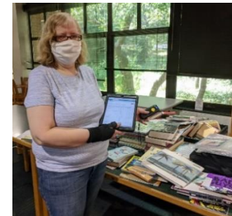
Scanning and processing books.